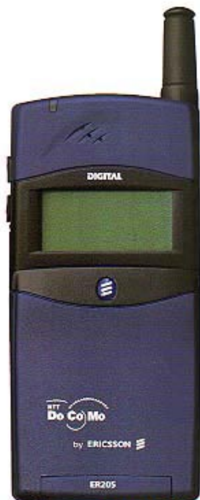
DoCoMo by ERICSSON ER 205 [Actual size]